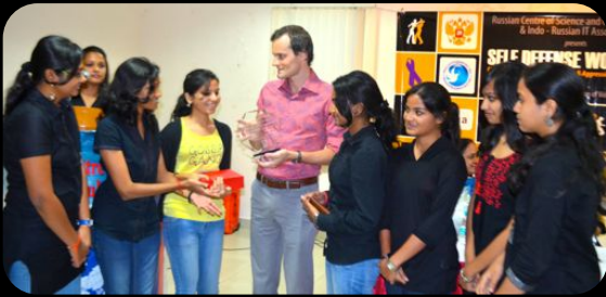
The Russian Dy. Consulate General felicitating the winners of the 2013 Autumn Leadership Camp during a special ceremony at the Chennai Russian Centre of Science and Culture.